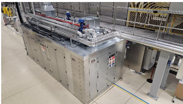
Figure 3: Another view of the heat pump installation.

The experience confirms that high-temperature heat pumps can reliably replace or supplement fossil-fuel-based steam boilers in industrial drying and other process applications. The project has also strengthened cooperation between technology suppliers and end users, setting an example for further rollouts across Philip Morris International’s production network and beyond.